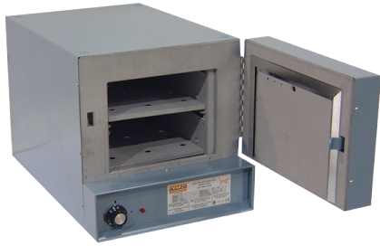
Compact In-Shop Models...