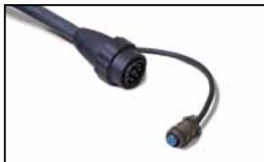
Mechanized torch lead with quick disconnect.