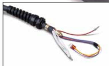
Handheld or mechanized torch lead without quick disconnect for Powermax600 CE systems.