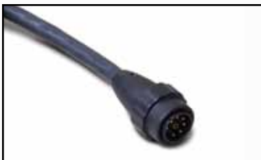
Handheld torch lead with quick disconnect.

Duramax retrofit torches are available with and without quick disconnects, to make retrofitting easy.