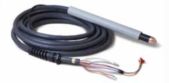
1 year torch and lead warranty