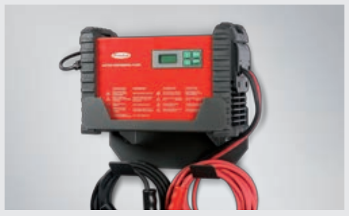
Optional accessories - wall bracket