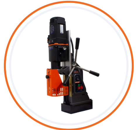
Metal guard system supplied as part of a comprehensive kit package