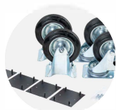
Castor kit CAS160-KS-FX-SB-CP