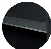
FittingStor shelf FC-S