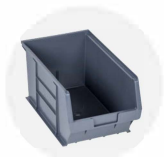
Fittings bins FCB