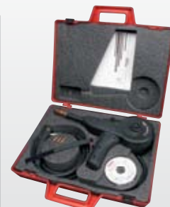
Aluminium kit K2532-1