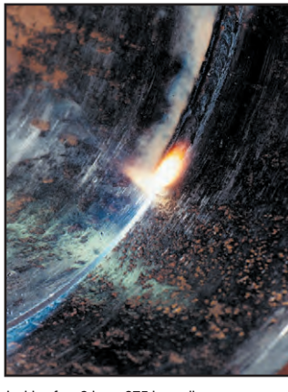
Inside of an 8 in. x .375 in. wall API 5L-X52 pipe, welded in 5G position.