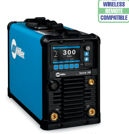
Dynasty 300 Machine only

MIG/MAG (GMAW) Mode - allow the operator to attach and run a suitcase feeder off the power source for high productivity welding.