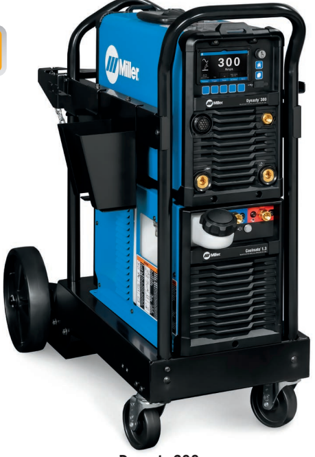
Dynasty 300 water cooled Tigrunner package