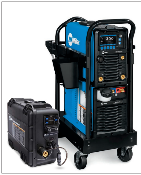
Dynasty® 300 DX Multiprocess with Coolmate™ 1.3 and ArcReach® SuitCase® 12