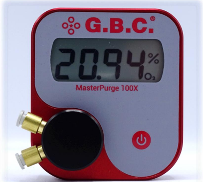
Robust aluminium enclosure and enlarged LCD display make the MP100X extremely user friendly.

GBC's MasterPurge 100X Weld Purge Monitor is a high quality, simple to operate handheld gas analyser measuring oxygen content in weld purge operations down to 0.01% O 2 content (100PPM). Housed in a machined aluminium case, the MP100X is a robust, reliable, and revolutionary product suitable for most weld purging operations on stainless steel, duplex, super duplex and other alloy steel materials.