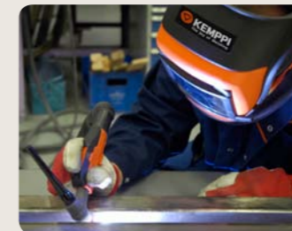
MicroTack welding is an easy and fast way of improving the quality and productivity of welding.