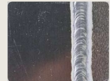
The MIX TIG function combines the good qualities of direct and alternating current. It makes joining aluminium materials easy and decreases the number of deformations.