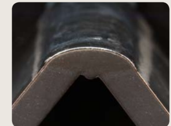
A stable arc ensures a smooth weld and strong base material attachment, thus ensuring good mechanical properties for the joint.

By increasing the proportion of AC, you attain a better cleaning effect, while increasing DC provides better penetration.