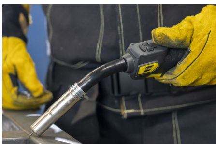
Exeor MIG Torch with remote control