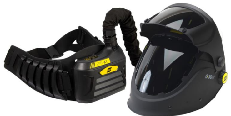
G30 Air with ESAB PAPR