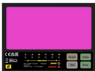
New multi-color LED display