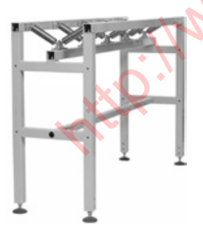
Pipe feeder extension unit

To extend the the base unit, can be used singularly or in multiples, easily bolted together.