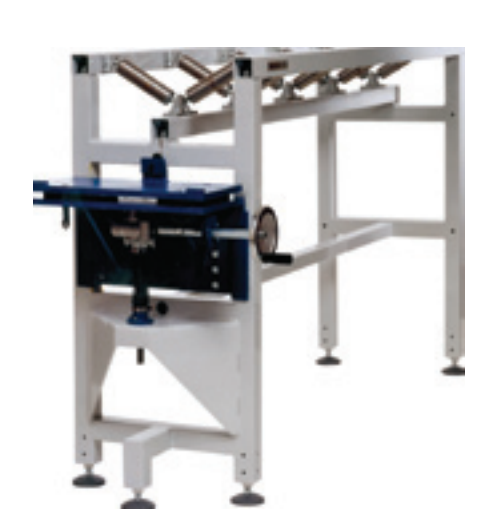
Pipe feeder base unit