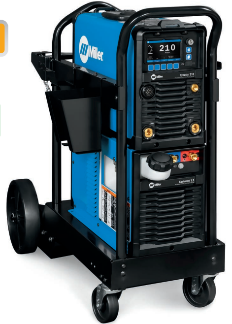
Dynasty 210 water cooled Tigrunner package

Blue Lightning<sup>™</sup> provides more consistent high-frequency (HF) arc starts and greater reliability compared to traditional arc starters.