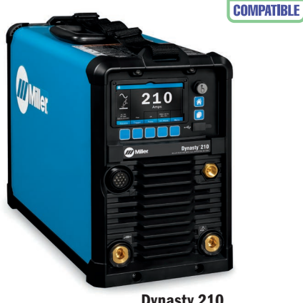
Dynasty 210 Machine only

Locks and limits. Provides control of weld parameter ranges minimizing deviation from the welding procedure specification (WPS).