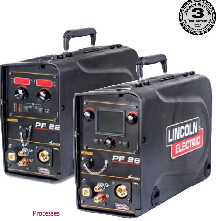
Pulsed MIG·MIG·MIG-STT® · Flux-Cored · Stick · TIG · Gouging

Top class Power Feed®26 utilizes TFT colour display with intuitive icon language and variety of special functions. Enables connection of push-pull gun allows you great performance on aluminium. Power Feed®26 combines all functions with USB connection, dual procedure, memory and limits.