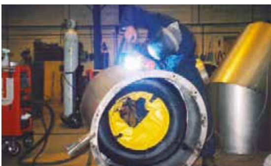
Speedy Purge used to weld a stainless steel elbow.