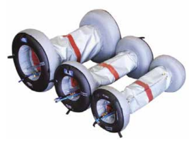
Speedy purge heat resistant bags