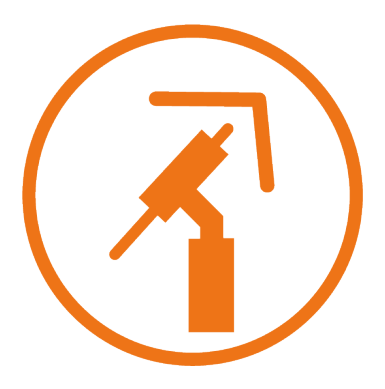
USABILITY MEANS EFFICIENCY

Unique and innovative handle flexibility moves the moment of load away from the welder's wrist